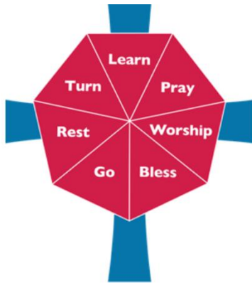
THE WAY OF LOVE Practices for Jesus-Centered Life