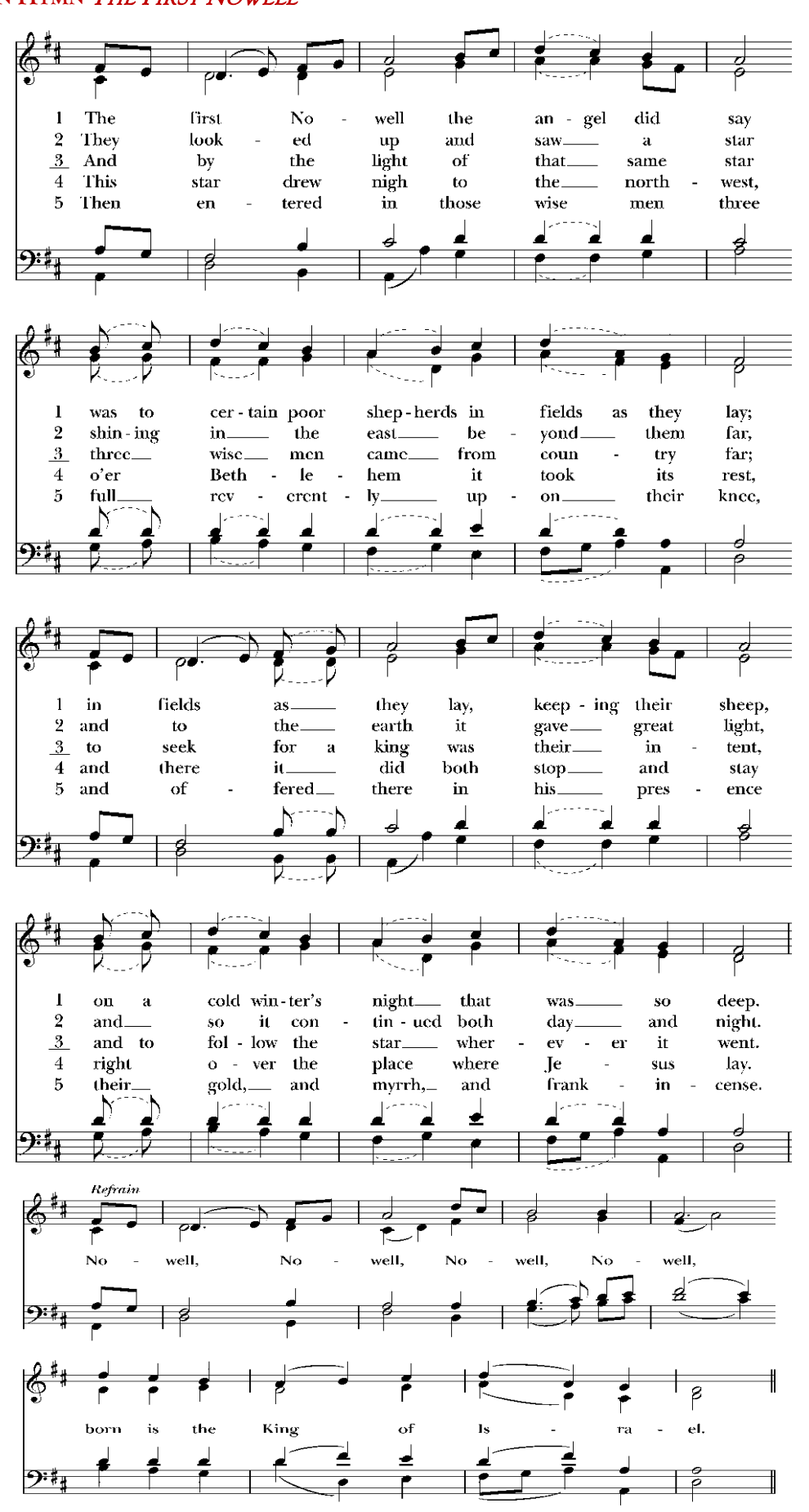
Then let us all with one accord sing praises to our heavenly Lord; that hath made heaven and earth of nought, and with his blood our life hath bought.