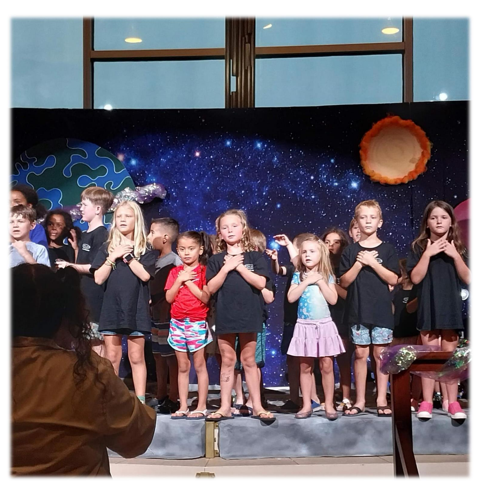
CELEBRATING VACATION BIBLE SCHOOL 2023: STELLAR—SHINE JESUS'S LIGHT!

WELCOME ALL! SEE THE BULLETIN BACK COVER FOR VISITOR AND NEWCOMER NOTES