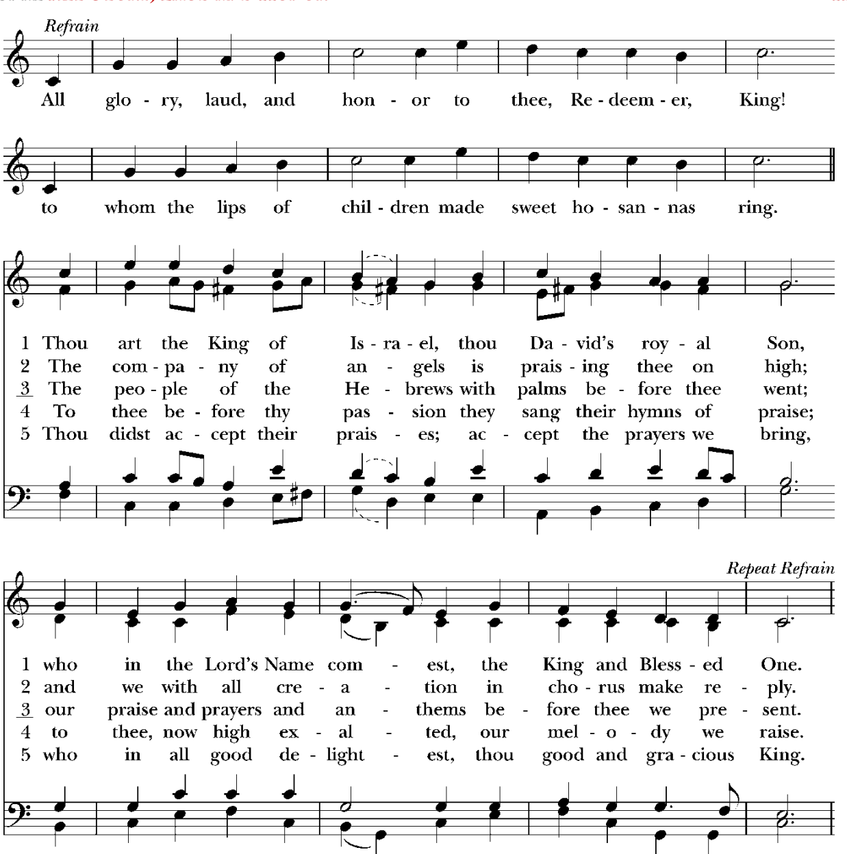
The stanzas may be sung by choir alone or alternately by contrasted groups; all sing the refrain.