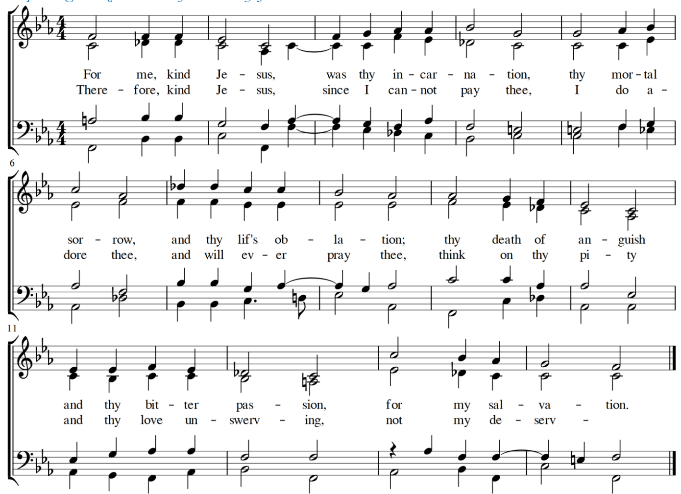
The People sing stanzas 4 & 5 of "Ah Holy Jesus".

what had taken place, they returned home, beating their breasts. <sup>49</sup>But all his acquaintances, including the women who had followed him from Galilee, stood at a distance, watching these things.