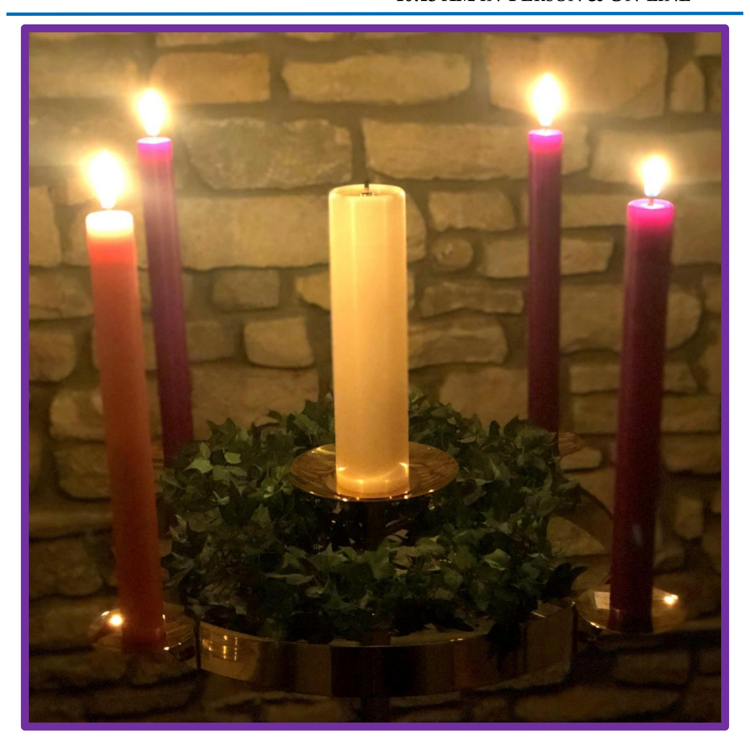
ST. LUKE'S ON THE LAKE EPISCOPAL CHURCH | AUSTIN, TEXAS

THE HOLY EUCHARIST: RITE II SUNDAY, DECEMBER 19<sup>TH</sup>, 2021 10:15 AM IN-PERSON & ON-LINE