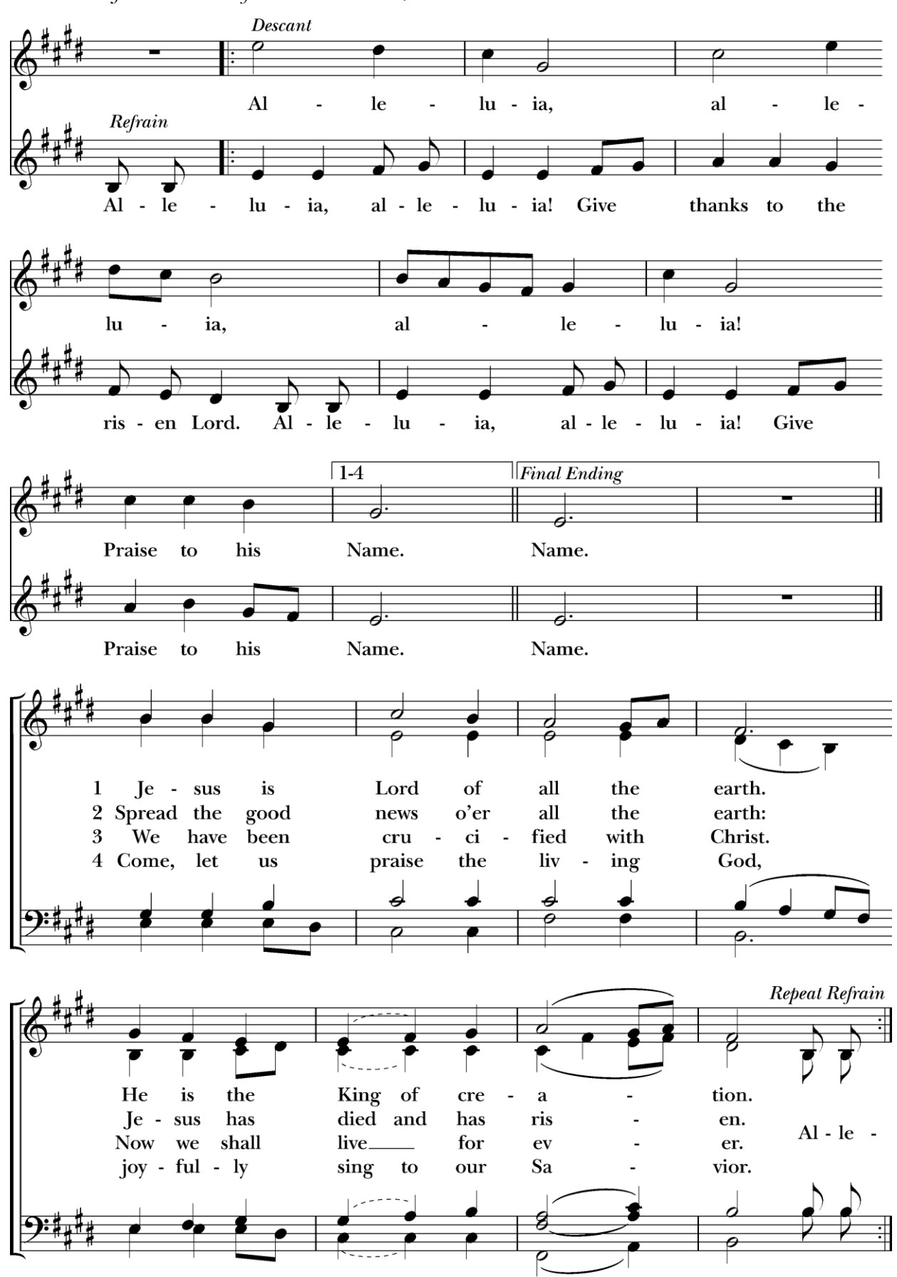
The descant may be sung after stanzas 3 and 4.