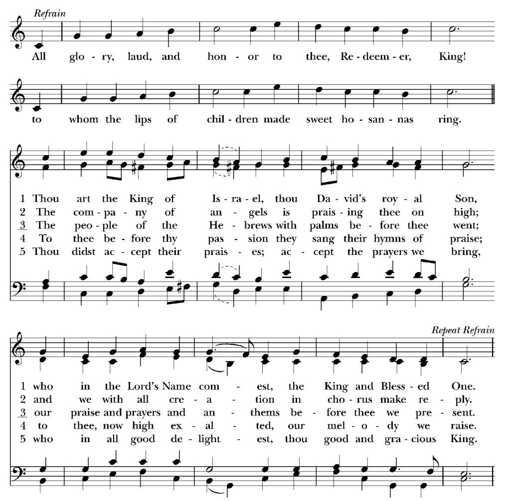
The stanzas may be sung by choir alone or alternately by contrasted groups; all sing the refrain.